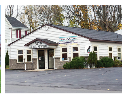
Fulton Animal Hospital