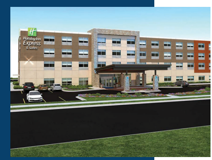
Holiday Inn Express