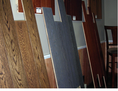
Designer Hardwood Flooring CNY